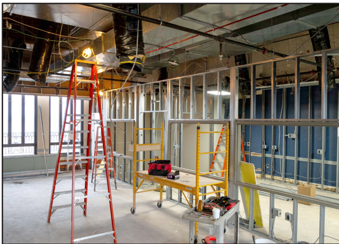
Construction is underway on the new Simulation Training Center on Faith 7

Providing safe and effective care for medically complex residents requires specialized training, and simulations have proven advantages over traditional teaching methods. Evidence shows that clinical skills acquired in medical simulation settings transfer directly to improved patient care practices and better patient outcomes.