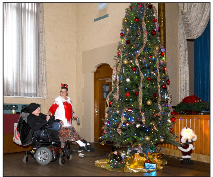
Photos from the annual Tree Lighting Ceremony which kicked off the holiday season at MCH!