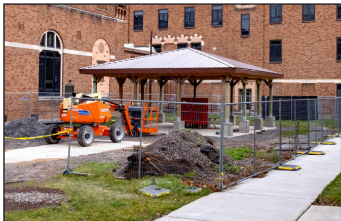
The new pavilion in the enclosed courtyard is completed