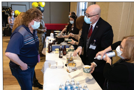
Photos from the first Spotlight Award ceremony.