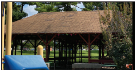
Photos of the Stan Yale Pavilion, located on the northeast corner of the campus, before and after the new metal roof was installed.

Stan Yale Pavilion roof replacement: The failing asphalt roof on the Stan Yale pavilion was replaced with a metal roof with a lifetime warranty.