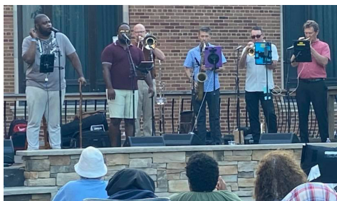
Enjoying some tunes at the annual Memorial Day Concert