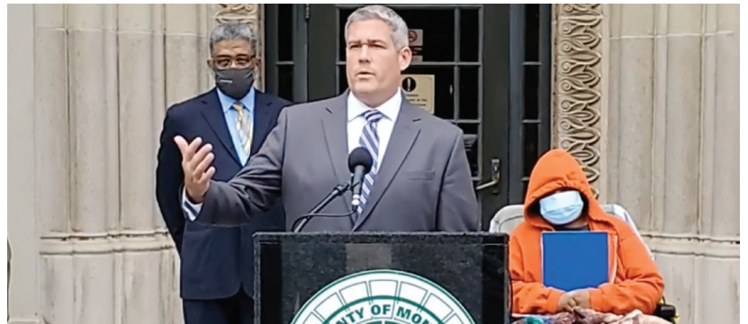
Calling out Fresenius at another press conference, where he criticized them for pulling dialysis treatment services from MCH