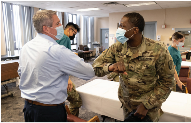
At an event to thank the National Guard for their assistance here at MCH!