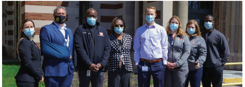
Joined by the MCH team for a press conference announcing a new taskforce to research and make recommendations about the healthcare staffing shortages,