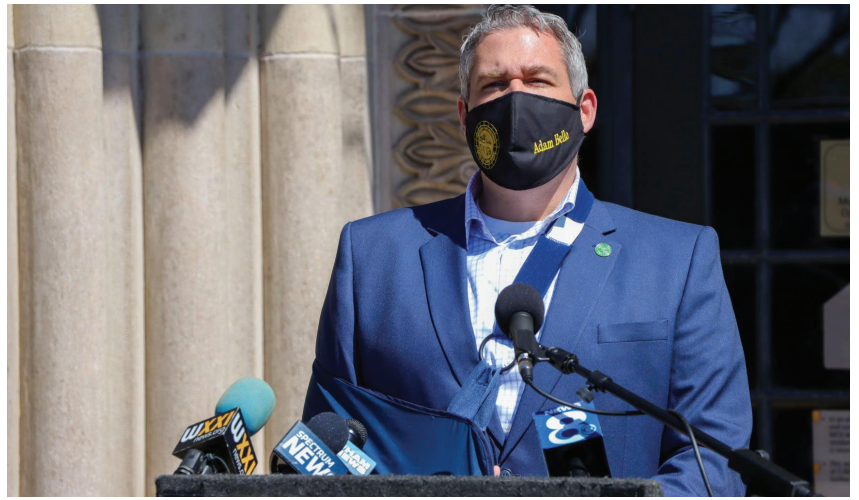
At a press conference announcing that he would hike the minimum wage to $15 an hour for all County employees, which had a major impact here at MCH