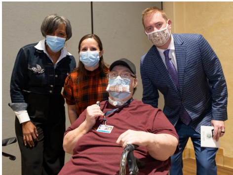
Celebrating Veterans Day with a meet-and-greet for our Vets here at MCH