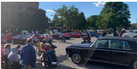
Checking out all of the cool cars at our annual Classic Car Show