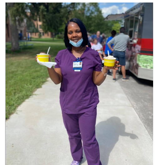
Enjoying some sweet treats at our Ice Cream Social