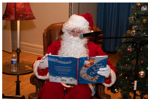
Annual tree lighting ceremony to kick-off the holiday season