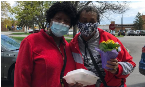
Recognizing our amazing volunteers as part of National Volunteer Week

Mostly thanks to the Resident Programs Department, who plan and execute so many events for us throughout the year, our residents and staff alike have lots of fun activities to enjoy! Take a look at just a few of the many safe, fun gatherings we were able to enjoy together, even with the challenges presented by COVID. A good time was had by all!